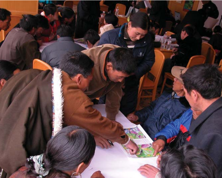
Planning forest ICCAs in Song Pan County, Sichuan, China.

It is interesting to note that the SCBD provided the following guidance to CBD COP10 (document COP/10/INF/12/Rev.1): “All terrestrial, freshwater and marine ecosystems provide multiple ecosystem services. However some ecosystems, such as those that provide ecosystem services related to the provision of water, are particularly important in that they provide services that are essential for human wellbeing and specifically for the lives and livelihoods of women, and indigenous and local communities, including the poor and vulnerable. Accordingly, priority should be given to safeguarding or restoring such ecosystems, and to ensuring that people, especially women, indigenous and local communities and the poor and vulnerable, have adequate and secure access to these services.”