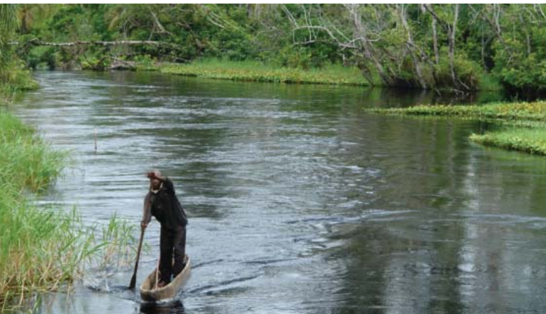
Man fishing in the Ndoki River

ICCAs incorporate systems of rules (written/unwritten, formal/informal), which are often a mix of disincentives (sanctions, penalties, etc. for violations) and incentives (ecosystem and economic benefits, awards, recognition, etc. for successful conservation / sustainable use). Where governments are recognizing ICCAs, there are often similar official systems of incentives and disincentives.