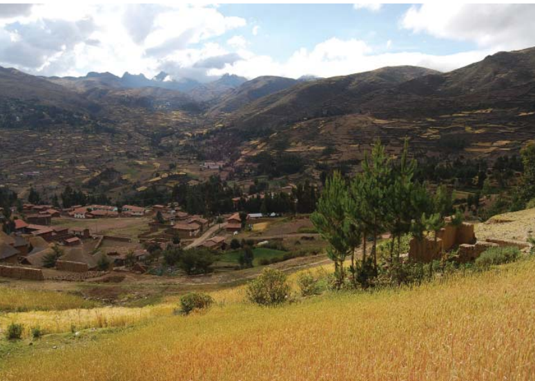
Parque de la Papa landscape, Peru.

In many parts of the world, conventional exclusionary protected areas have neglected or undermined such traditions and practices, leading to a loss of domesticated biodiversity and to knowledge relating to such diversity. In other areas, protected area strategies have actually taken on board domesticated diversity as either an explicit objective in its own right, or as a means of maintaining ecosystems that contain significant wild plant and animal diversity.