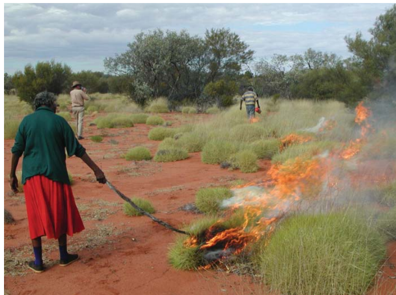
Burning spinifex grass for regeneration, Walakara IPA, Australia

ICCAs, including both the ones that are a continuation of lives and lifestyles from the past, and those established or revived in more recent times, involve collective knowledge and awareness of the values of biodiversity. This is sometimes implicit in cultures and lifestyles, sometimes stated explicitly as a goal or objective worth striving for. In all cases where ICCAs have been recently established or revived, or where threats to ancient ICCAs have been recently tackled, there is fresh awareness of the values of nature and the steps needed to conserve it. The ICCA Consortium has developed a self-evaluation tool for ICCA strength and resilience, which provides a means for raising awareness within