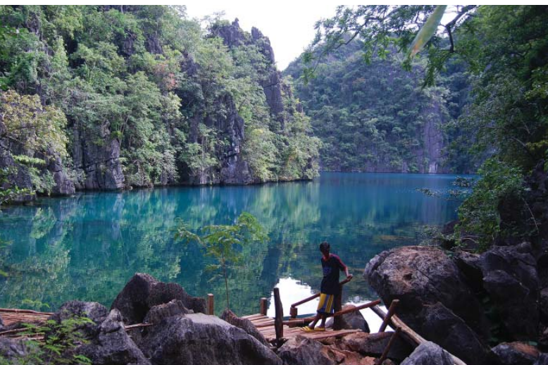
Coron Island, The Philippines.

ICCAs often provide best practices of secure access (of communities) to