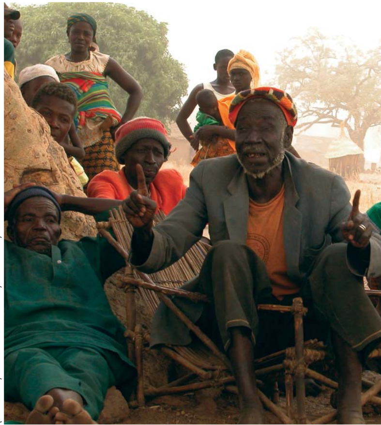
Explaining traditional conservation practices in Burkina Faso.

By 2020, the traditional knowledge, innovations and practices of indigenous and local communities relevant for the conservation and sustainable use of biodiversity, and their customary use of biological resources, are respected, subject to national legislation and relevant international obligations, and fully integrated and reflected in the implementation of the Convention with the full and effective participation of indigenous and local communities, at all relevant levels.