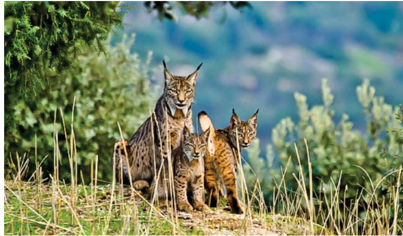
Iberian lynx in Dehesa, Spain.

ICCAs also incorporate significant local knowledge and practices that are crucial for an understanding of threats and needs of threatened species.